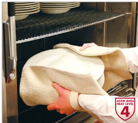
#BPEOB Bakers Pad