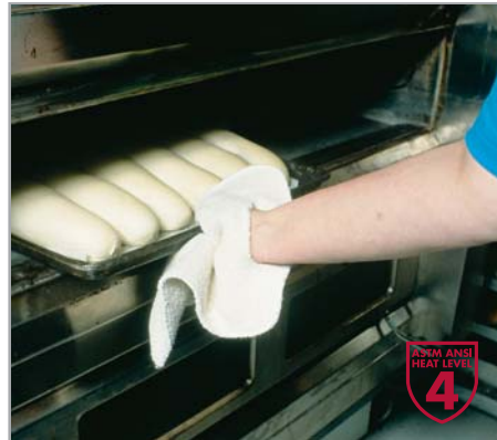
#BPS Bakers Pad