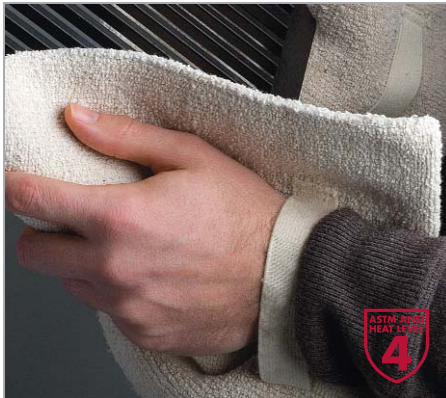
#BPE Bakers Pad

Thick terry provides maximum insulation from objects up to 450° F, while natural color hides stains better.