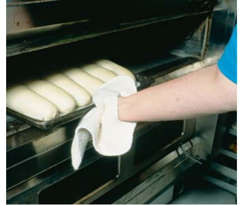
#BPS Bakers Pad