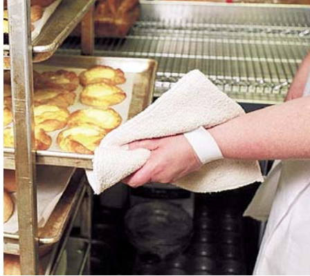
#BPE Bakers Pad

We offer a range of protection against thermal burns for workers handling hot objects in food processing applications. Cotton terry pads and gloves are a wise choice for bakers, when the burn risk is dry. For those handling large vessels involving liquids and oils, neoprene offers protection against both dry and steam burns and scalding, as the material is liquid-repellant, and has a higher insulation value than cotton terry. Neoprene also features excellent grip for both wet and dry objects.