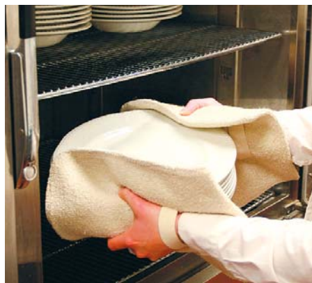
#BPEOB Bakers Pad