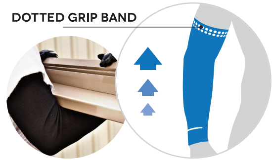
DOTTED GRIP BAND

No more slipping! Sleeves with arm openings featuring "STAYz-Up" technology hold up—comfortably gripping onto underlying fabric or skin to ensure sleeves stay in place, and keep you protected no matter what. Unlike other products on the market, we won't let you down.