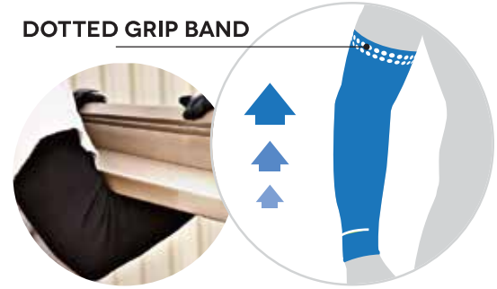
DOTTED GRIP BAND

No more slipping! Sleeves with arm openings featuring "STAYz-Up" technology hold up—comfortably gripping onto underlying fabric or skin to ensure sleeves stay in place, and keep you protected no matter what. Unlike other products on the market, we won't let you down.